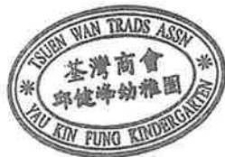
Tang So-Hing Principal