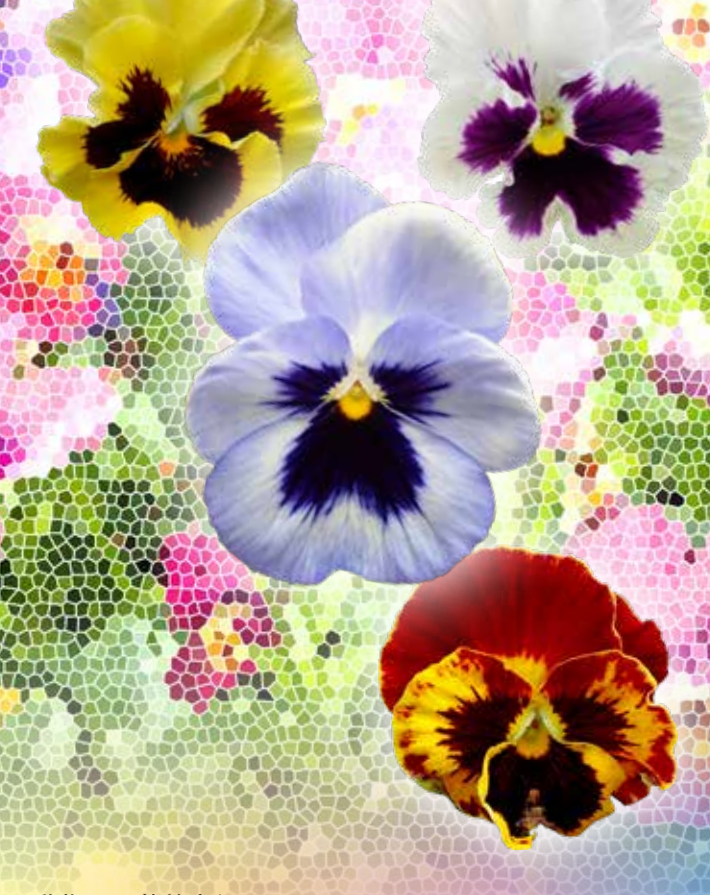
動物及園藝教育組 Zoological and Horticultural Education Unit